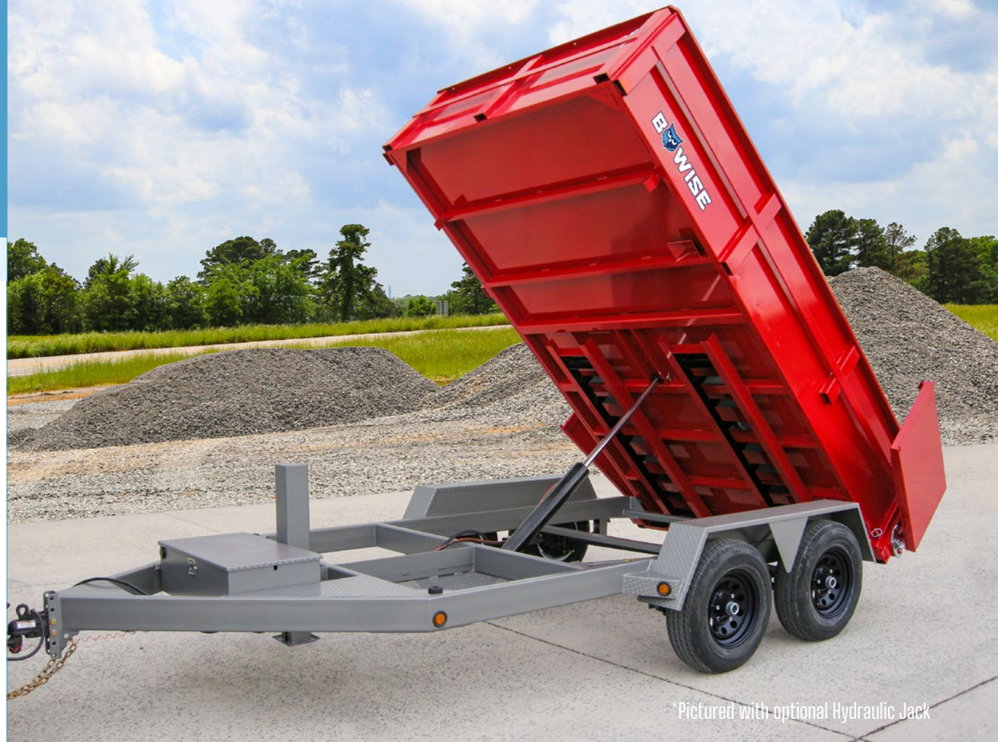
*Pictured with optional Hydraulic Jack